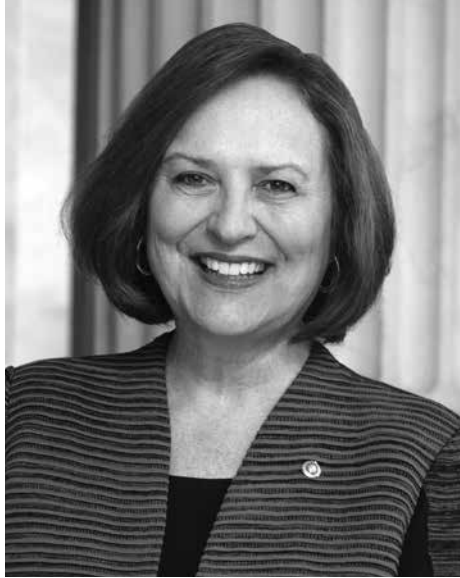
DEB FISCHER UNITED STATES SENATOR FOR NEBRASKA

Deb Fischer is the senior senator from Nebraska and was elected to the U.S. Senate in 2012 and again in 2018. Senator Fischer serves on the following five Senate committees: Armed Services, Commerce, Agriculture, Rules, and Ethics.